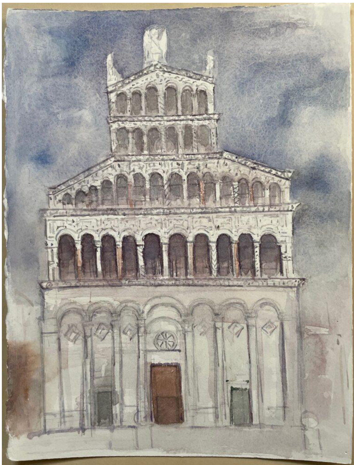
San Michele in Foro. Lucca, Italia