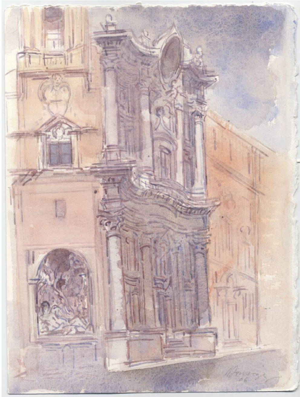
San Carlo alle Quattro Fontane. Roma, Italia