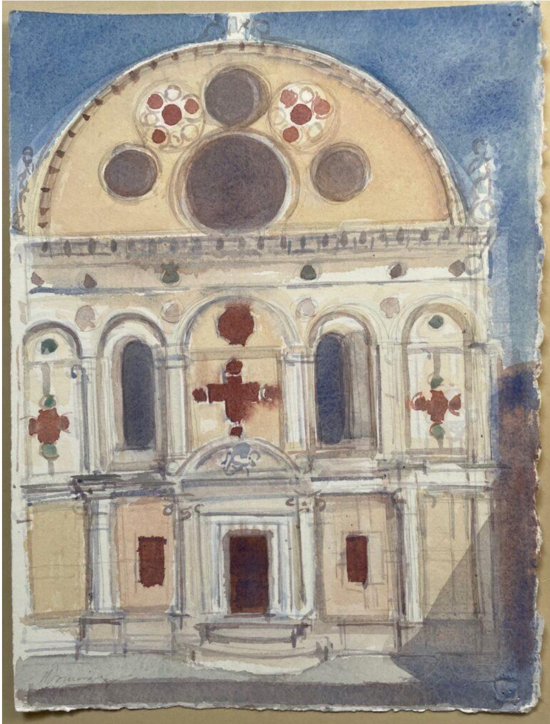
Santa Maria Miracoli, Venezia. Italia