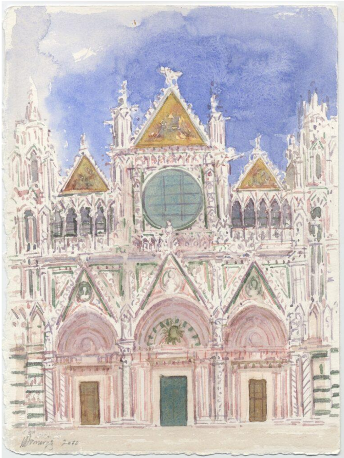
Siena Cathedral. Italia