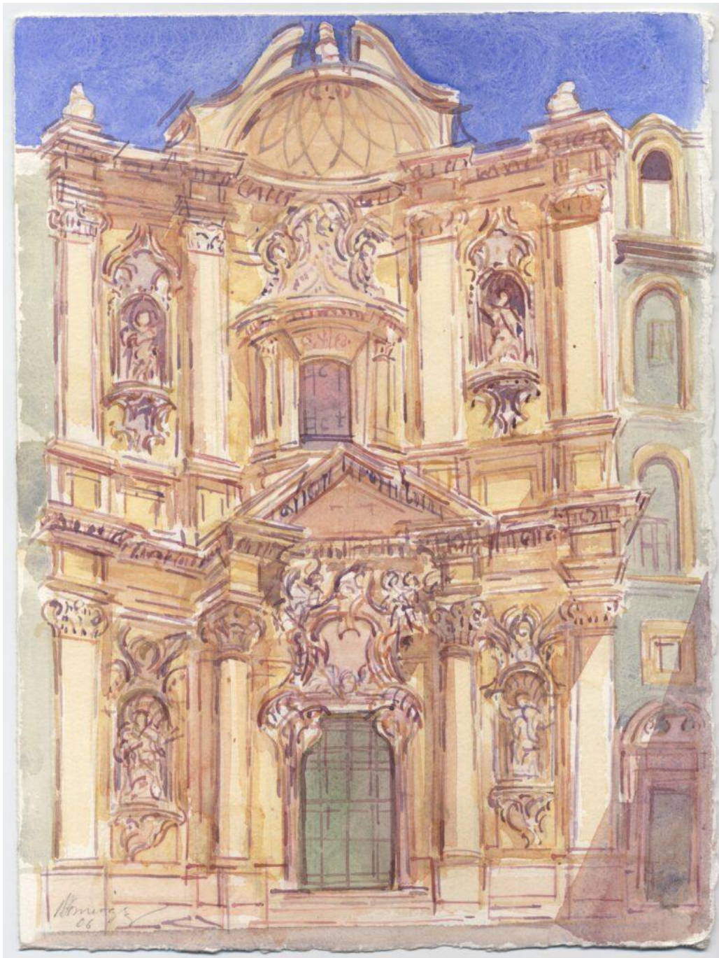
Chiesa di Santa Maria Maddalena. Roma, Italia