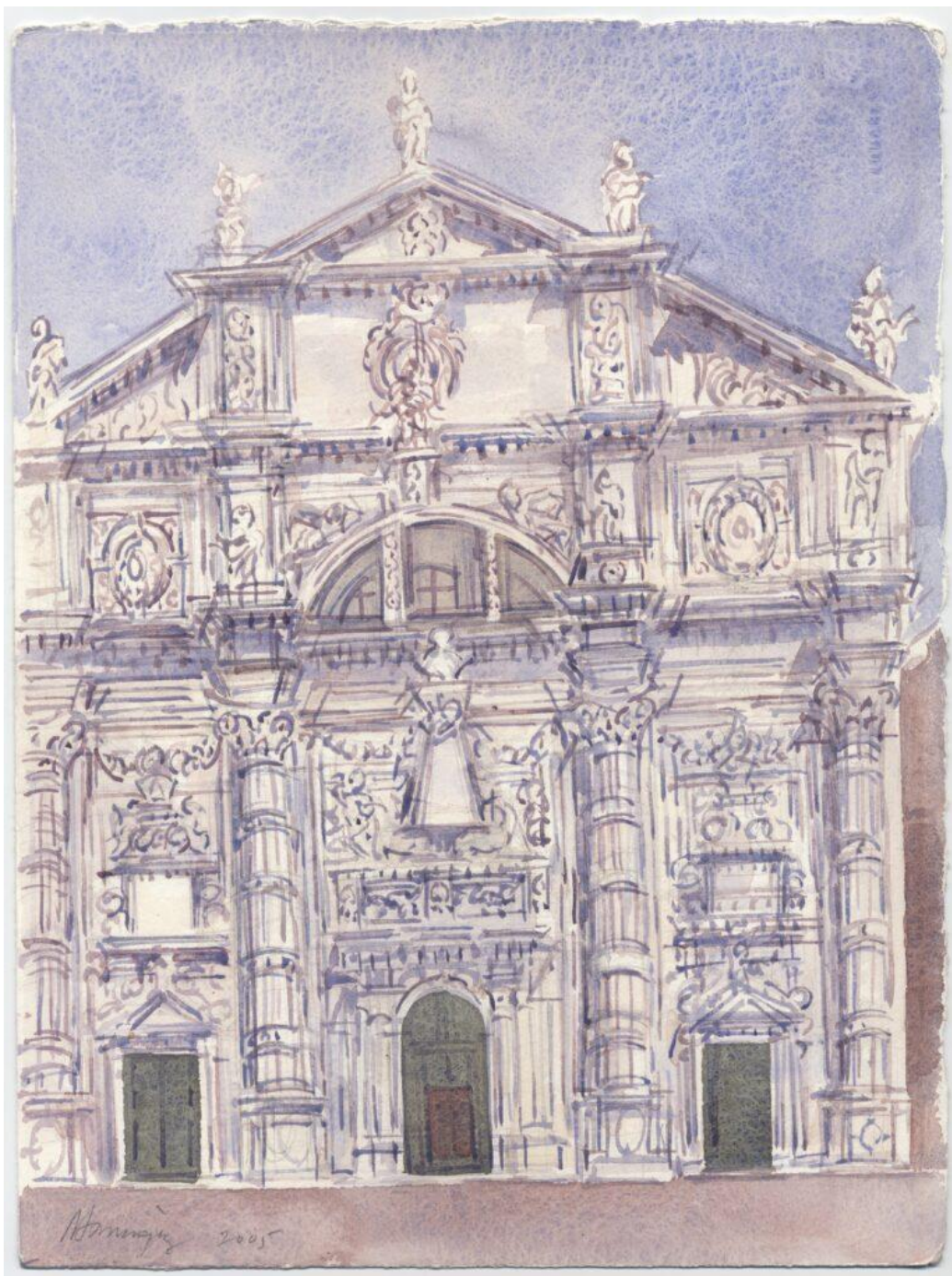
Chiesa di San Moise. Venezia, Italia ...