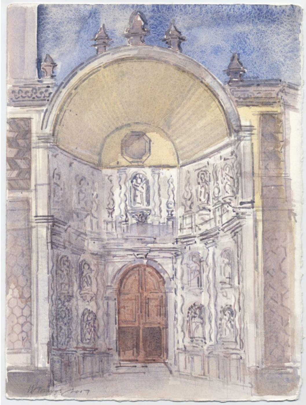
San Juan de Dios. Guadalajara, Mexico

All artworks are watercolor on rag (archival) paper 15 x 11 inches)